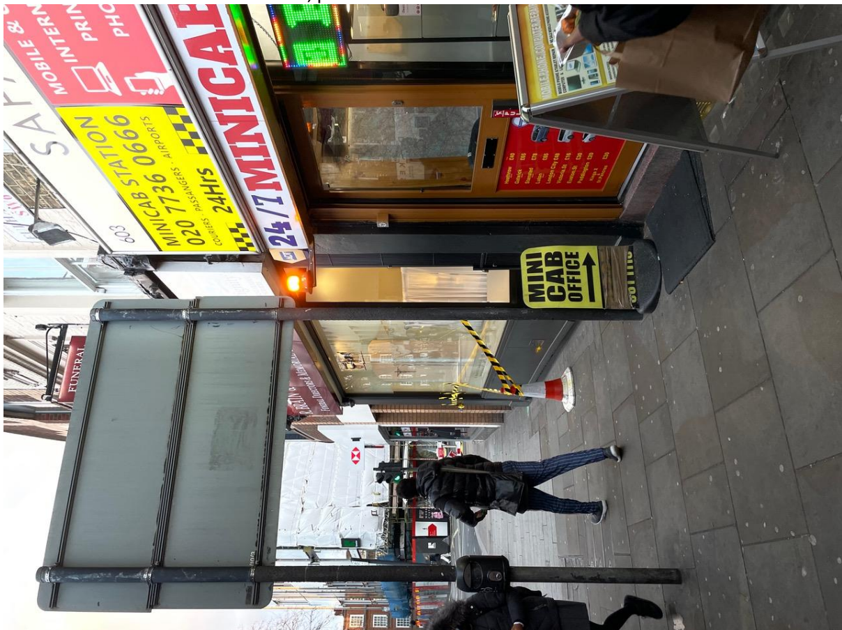
FUNERAL DIRECTORS 601 Fulham Rd, photo

These photos give an impression of the physical damage caused by incidences along this parade of shops. We believe it supports our request to not extend hours at 607 Fulham Road as the Crime and Disorder as well as Public Safety issues around and very close to 607 are severe, and unfortunately increasing over time.